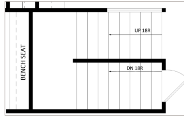
Optional Basement Stairs