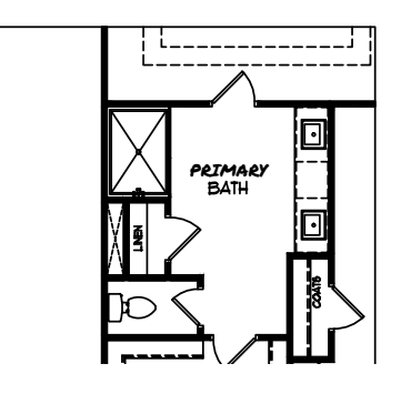
OPT. PRIMARY BATH SUPER SHOWER