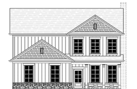
This architectural drawing shows a two-story house with a stone foundation. The exterior walls are finished with horizontal siding. The house features a central entrance with a small porch supported by columns. There are several windows, including a large bay window on the right side of the ground floor and a smaller window on the left. The roof is gabled, and the gables are finished with a patterned material, possibly shingles or a decorative siding. The drawing is a black and white line art illustration.